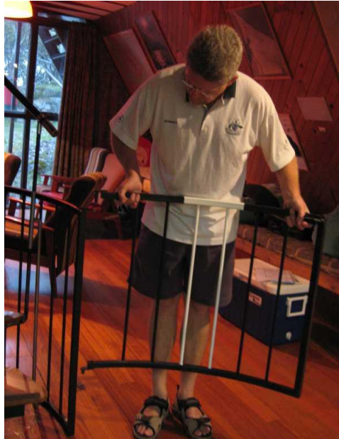
1. Attach safety gate to hinge.

To close stairs (upper or lower) to toddlers or younger children attach safety gates that are stored at the foot of stairs. To install follow the below steps: