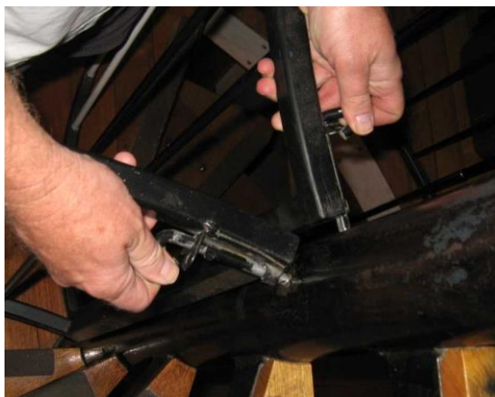
2. Lock gate in place at centre post.